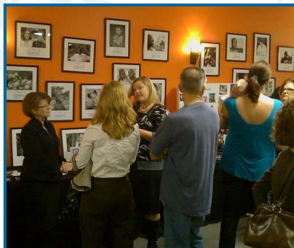
Orphan Sunday Exhibit at Seacoast Church, Myrtle Beach, SC

As most of our readers know by now, the South Carolina Heart Gallery began in 2005 with a small number of community volunteers and photographers who wanted to help find adoptive homes for children in foster care. By 2008 it was clear that the Heart Gallery was effective in educating the public about the need for foster and adoptive homes, as well as increasing child-specific adoption recruitment opportunities. In July 2008 a collaborative partnership was formed between the Children's Foster Care Review Board and the South Carolina Department of Social Services. This partnership enabled contractual funding to expand and enhance the Heart Gallery and provided a full time staff person to oversee its mission. The Heart Gallery was included in the State DSS Marketing and Recruitment Plan, and Regional Adoption Recruiters fully embraced their additional role in managing referrals, scouting locations for photo shoots, and assisting in finding community venues for photo exhibits.