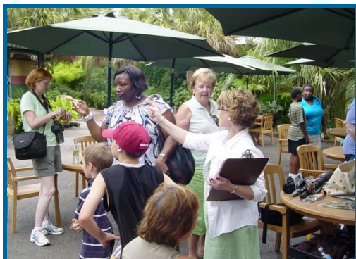
Photo Shoot at Riverbanks Zoo Columbia, SC

From 2005 through 2008, beautiful portraits of 334 children were created by Heart Gallery photographers. The resulting portraits were featured in public venues around the state, as well as on the Heart Gallery website at www.scheartgallery.org . Multiple exhibits, presentations to community groups, and television and print media led to a huge jump in website traffic and inquiries from families interested in adopting. Best of all, 40% of the children featured by the Heart Gallery during this time were matched with prospective adoptive families!